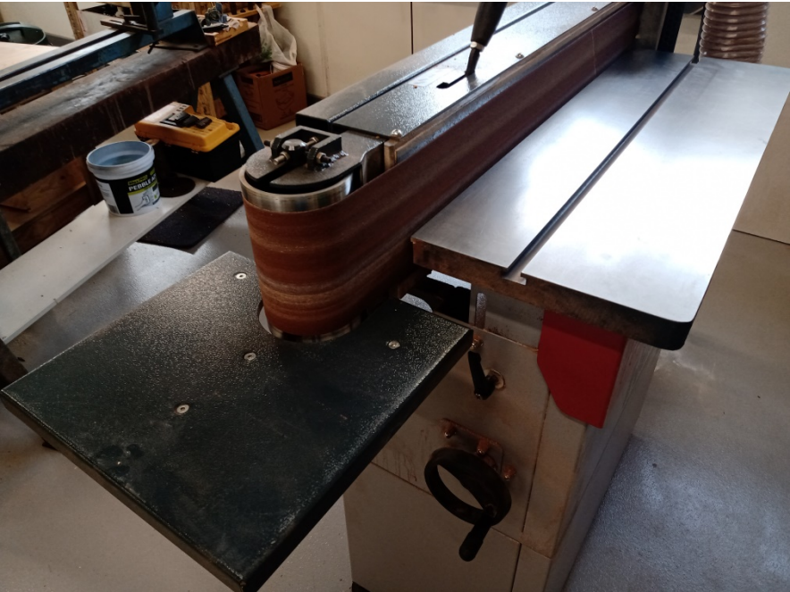
Figure 1, The Hammer belt sander