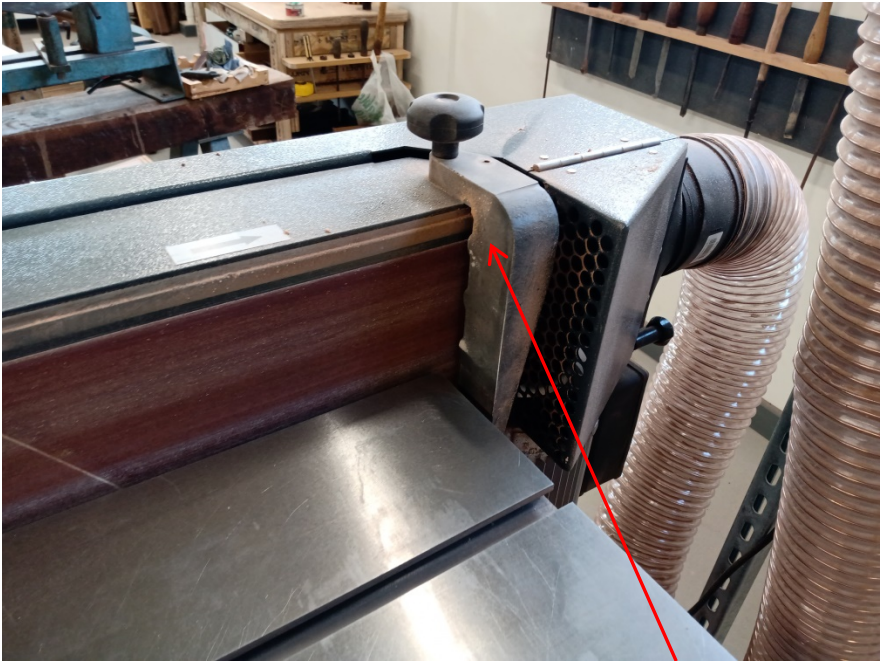
Figure 2, please note the stop