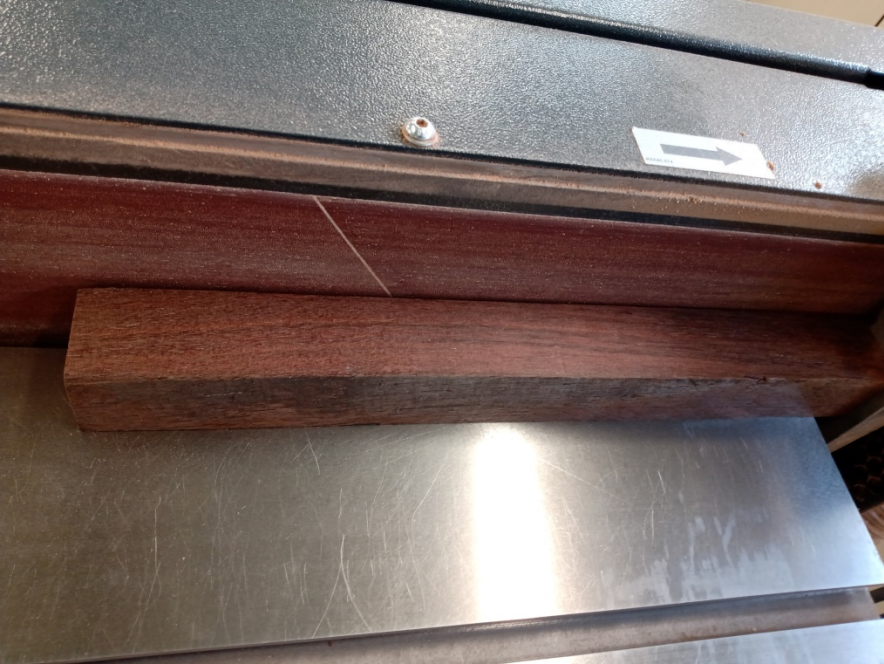
Figure 3, please note timber against the stop and trailing edge making contact first